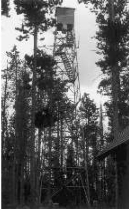
Last Updated 10/3/2022