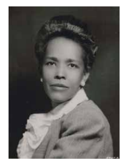
Ella Baker served as an activist from the 1930s to 1980s, working in several major organizations. Her papers are archived at the New York Public Library's Schomburg Center for Research in Black Culture.

Students interested in civil rights might investigate the role women played in the movement. Consider debates that occurred between African American women and their male counterparts. How did this affect and shape the movement? For instance, Ella Baker, a major proponent of the Civil Rights Movement, fought sexism in both the National Association for the Advancement of Colored People (NAACP) and the Southern Christian Leadership Conference (SCLC).<sup>1</sup>What were the results of these debates? Baker eventually left to help organize and advise the Student Nonviolent Coordinating Committee (SNCC). What influence did she have on the Civil Rights Movement?