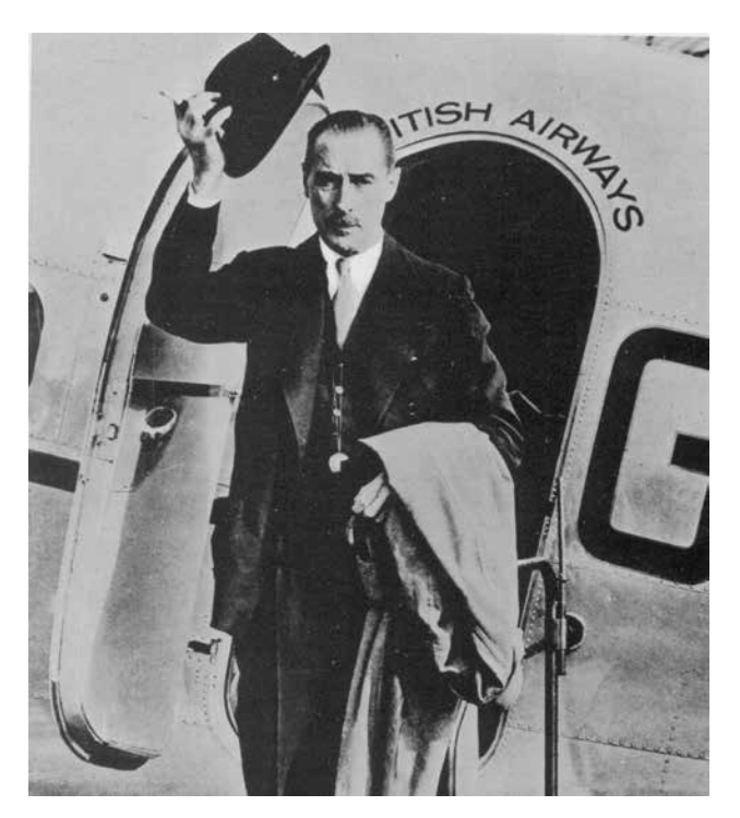
Nevile Henderson, the British Ambassador to Germany, departing Croydon Airport to fly to Berlin, Germany, August 1939.

What happens when diplomatic relations fail? Following the German invasion of Czechoslovakia (now the Czech Republic and Slovakia) in 1938, British Prime Minister Neville Chamberlain flew to Berchtesgaden, Germany, to meet German Chancellor Adolf Hitler. Chamberlain's goal was to appease Hitler and de-escalate the growing unrest in Europe. What diplomatic agreement resulted from this meeting? What happened when actors involved no longer wished to follow the guidelines set forth? What was the impact on Czechoslovakia? What were the ultimate consequences of appeasement? How did it set in motion a domino effect that led to World War II?