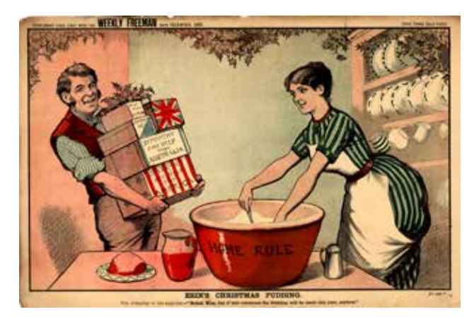
Erin's Christmas Pudding appeared in the December 24, 1887, issue of the Weekly Freeman magazine and showed international support to Ireland and the concept of Home Rule.

Think about how countries have interacted with each other. For instance, students might explore the heated debate between Ireland and Great Britain over the concept of Home Rule (1870–1919). Why was self-government important to the Irish? What debates occurred between Ireland and Great Britain due to this political movement? Did the debates lead to diplomacy on both sides? How was this debate viewed internationally? What were the short-term and long-term consequences?