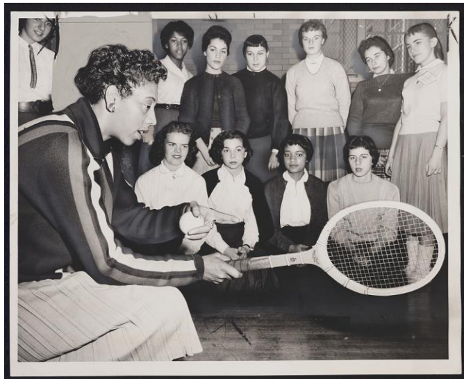
Althea Gibson, 1957

Despite playing during a time of widespread prejudice and racism, Althea Gibson was the first black player to win a Grand Slam. Here she is teaching a tennis clinic at a high school.