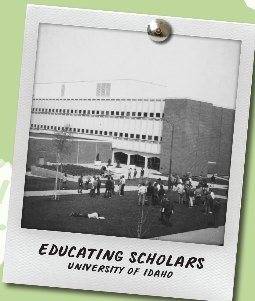
EDUCATING SCHOLARS UNIVERSITY OF IDAHO