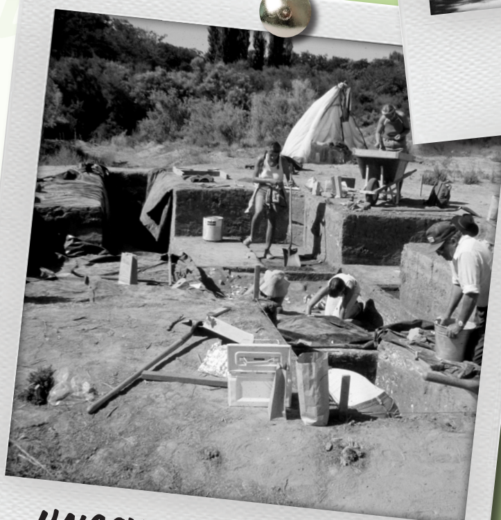
UNCOVERING HISTORY GIVENS HOT SPRINGS