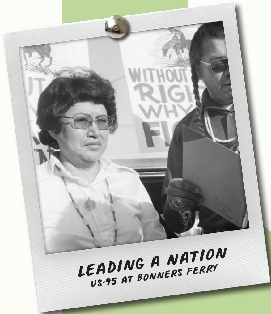
LEADING A NATION US-95 AT BONNERS FERRY