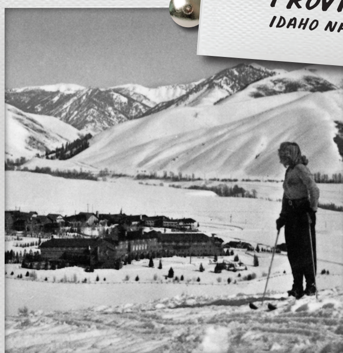
WINNING THE GOLD SUN VALLEY