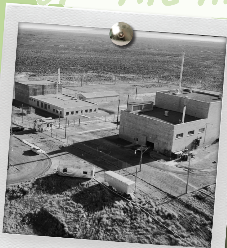
PROVING A THEORY IDAHO NATIONAL LABORATORY