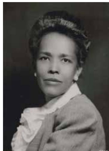
Ella Baker served as an activist from the 1930s to 1980s, working in several major organizations. Her papers are archived at the New York Public Library's Schomburg Center for Research in Black Culture.

Students interested in civil rights might investigate the role women played in the movement. Consider debates that occurred between African American women and their male counterparts. How did this affect and shape the movement? For instance, Ella Baker, a major proponent of the Civil Rights Movement, fought sexism in both the National Association for the Advancement of Colored People (NAACP) and the Southern Christian Leadership Conference (SCLC). 1 What were the results of these debates? Baker eventually left to help organize and advise the Student Nonviolent Coordinating Committee (SNCC). What influence did she have on the Civil Rights Movement?