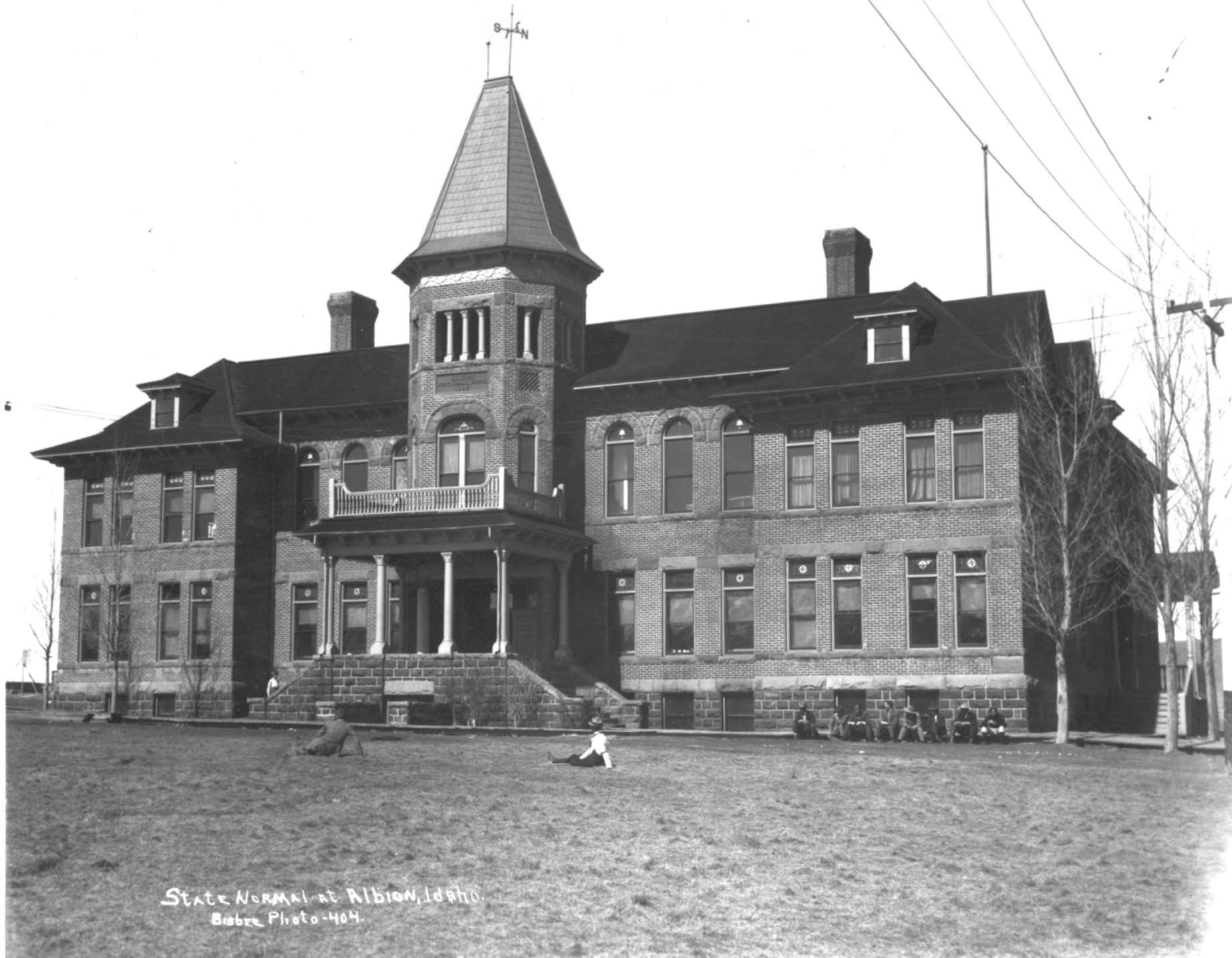
State Normal at Albion, Idaho. Bisbee Photo-404.