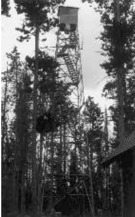
Last Updated 4/27/2018