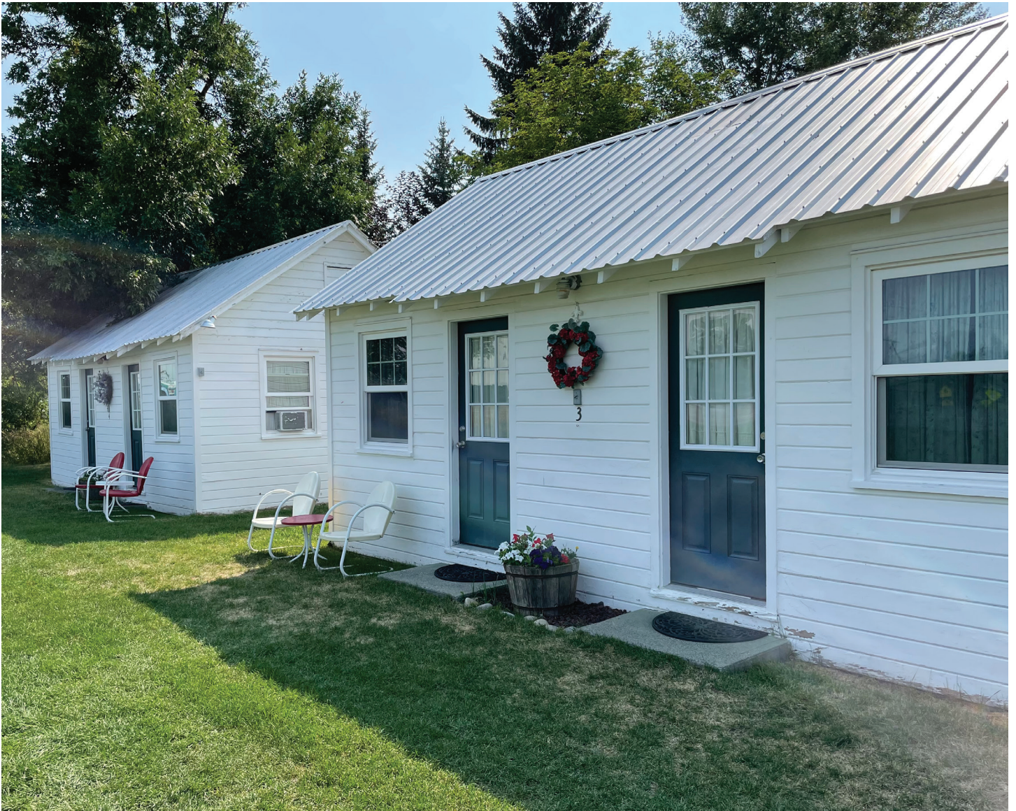
Rankin Auto Court Fremont County, ID

Idaho's CLG program has had a proven track record of successful projects and the State Historic Preservation Office continues work to meet the growing needs of CLG communities through grant funding and technical assistance.