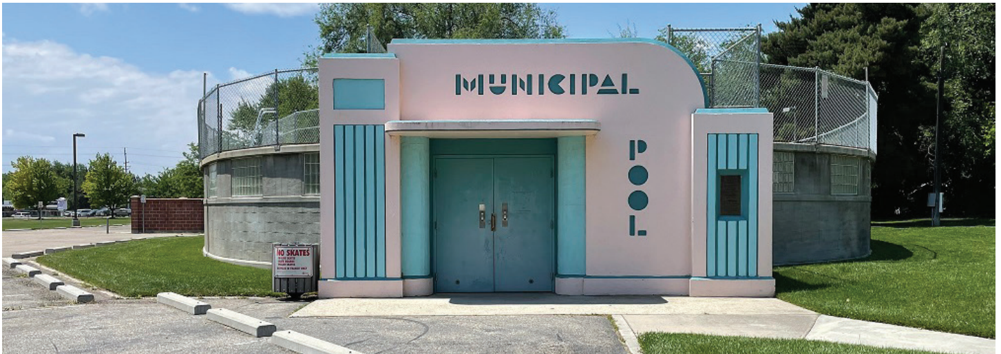
Lowell Municipal Pool Boise, ID (NRHP #100008169)

The top tools attendees felt are the most effective include: grants for rehabilitation or restoration of historic buildings; local historic preservation ordinances and enforcement; tax incentives for owners of historic properties; and training for government decision-makers.