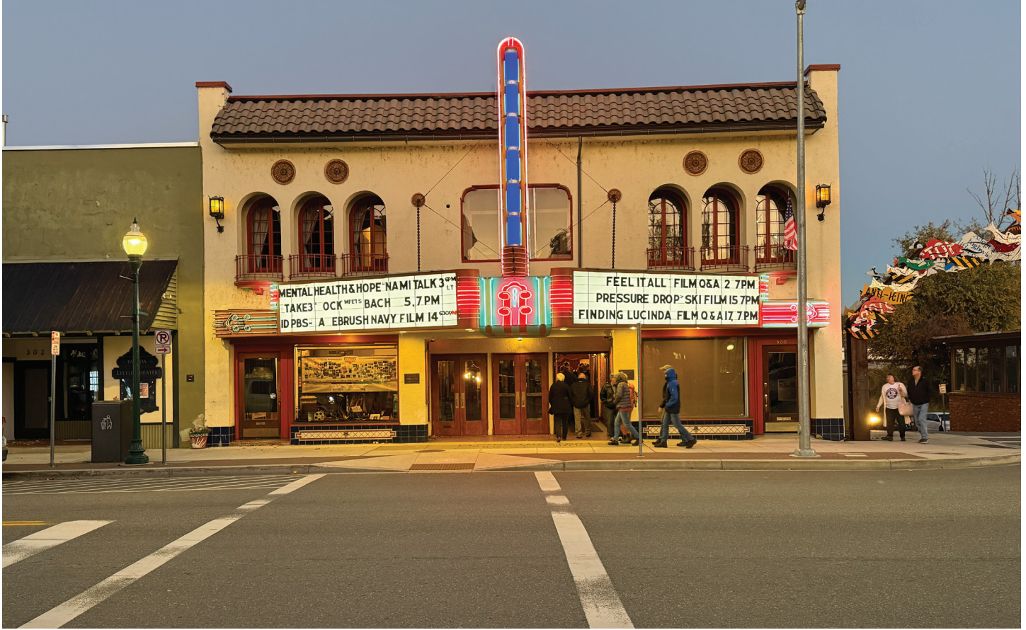
Panida Theater Sandpoint, ID (NRHP #8400100)