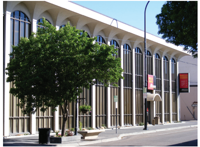
First Security Bank Idaho Falls, ID