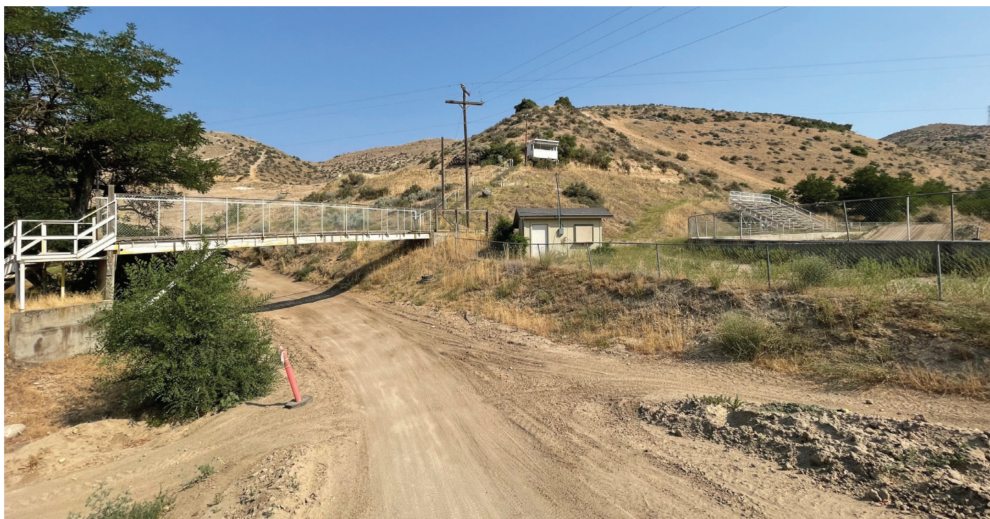
Owyhee Motorcycle Club, Ada County, Idaho (NRHP #100008236)

Idaho has a strong history of carrying out historic preservation efforts through a combination of private development projects, public/government agency actions, and dedicated grassroots endeavors. Among many other notable achievements, these efforts have resulted in the listing of a wide variety of historic resources in the National Register of Historic Places. Recent National Register listings, such as the Bethel Missionary Baptist Church in Pocatello (a major center of local Civil Rights activity), the Miner’s Hat in Kellogg (a remarkable example of programmatic roadside architecture), and the Owyhee Motorcycle Club in Ada County near Boise (the first motorcycle racing-related facility listed in the National Register anywhere in the country), recognize many unique facets of the state’s history for future generations.