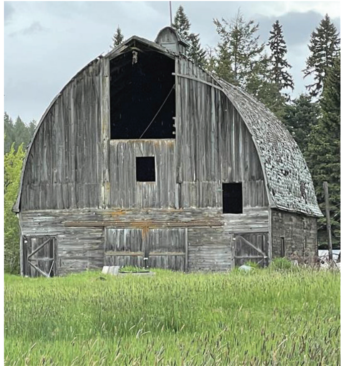
Slagle Barn Latah County, ID