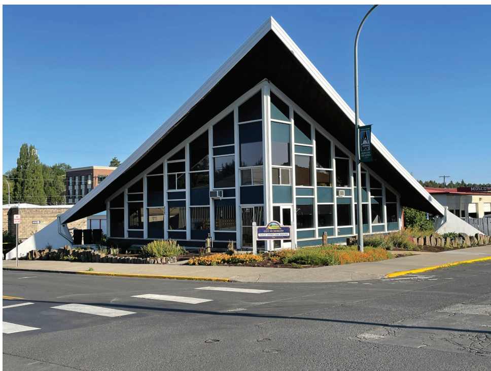
First Federal Savings and Loan Moscow, ID

LEED Leadership in Energy and Environmental Design is a “green” building certification program that recognizes best practices and best strategies for buildings that focus on sustainability through reducing their carbon footprint and using less energy, etc.