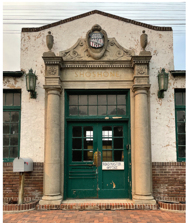
Union Pacific Depot Shoshone, ID (NRHP #75000636)