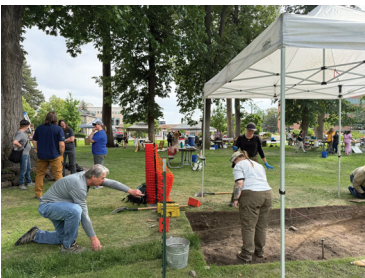
Garden District, Coeur d'Alene, ID

“Sites: A site is the location of a significant event, a pre- or post contact occupation or activity, or a building or structure, whether standing, ruined, or vanished, where the location itself maintains historical or archaeological values regardless of the value of any existing structure.”