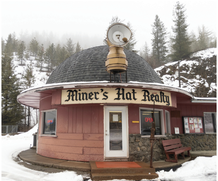
Miner's Hat Kellogg, ID (NRHP #100007007)

One requirement for the SHPO to receive the HPF grant is to provide and implement a Statewide Historic Preservation Plan (HPP). The Idaho SHPO represents the state and acts as a statewide steward for cultural resources across Idaho. SHPO staff advocate for, educate about, and encourage the prioritization of historic preservation through their daily work activities, workshops, conferences, field trips, training, educational programs/presentations, and on-line resources. The priorities set by the Idaho Historic Preservation Plan and Annual Work Plan reflect input from a wide variety of stakeholders and outline goals and objectives for agencies including SHPO as well as organizations and individuals supportive of historic preservation throughout the state.