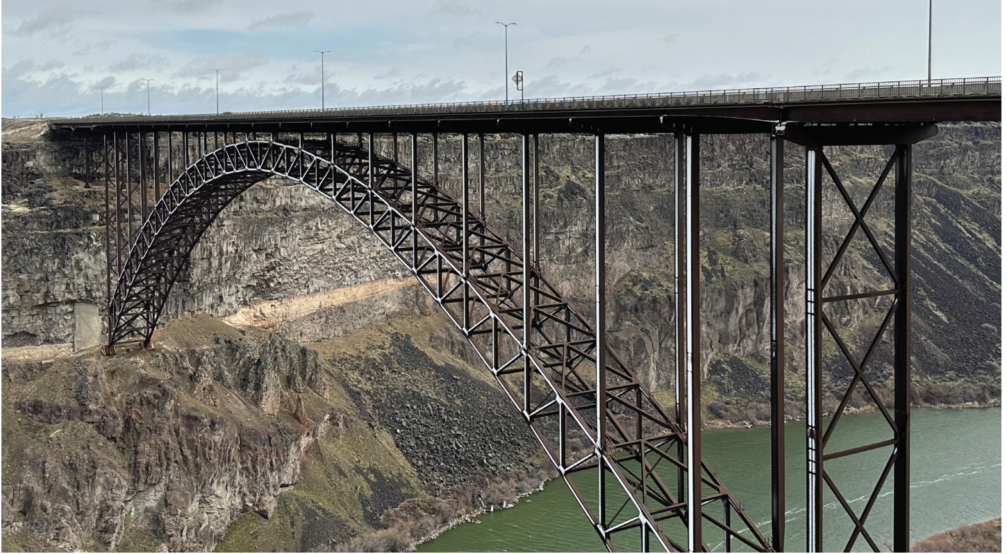
Perrine Memorial Bridge Twin Falls, ID