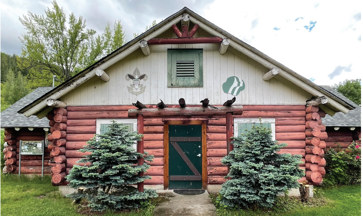
Kellogg Boy Scout Cabin Kellogg, ID (NRHP #100007006)