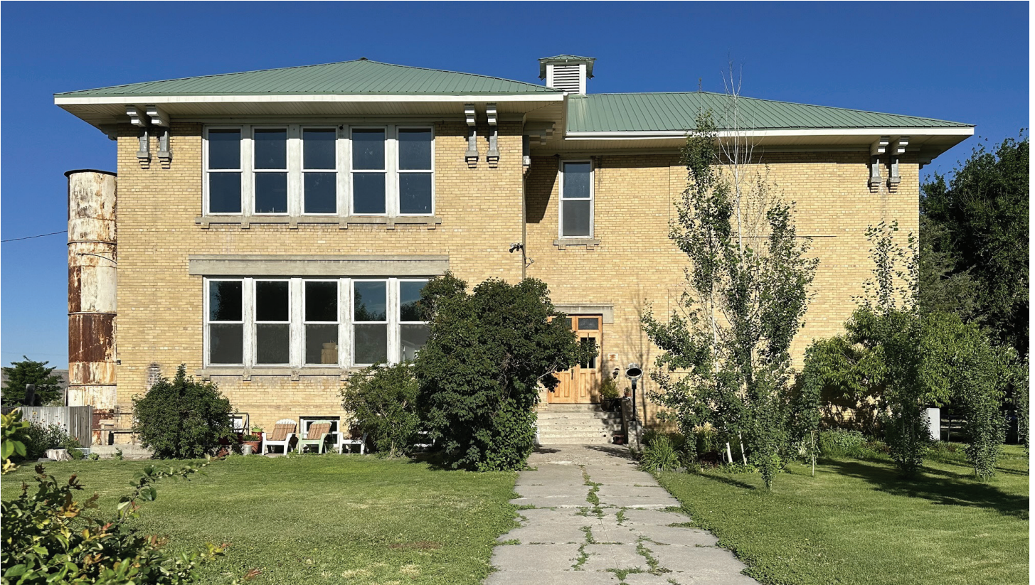
Hammett School Hammett, ID (NRHP #100010906)