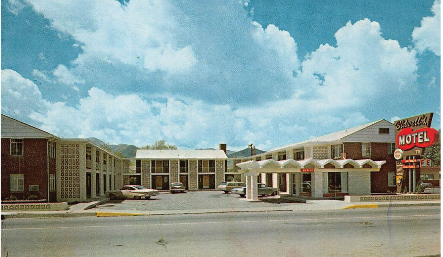
Bidwell Hotel and Apartments, listed in the Green Book between 1959 and 1966 Pocatello, ID