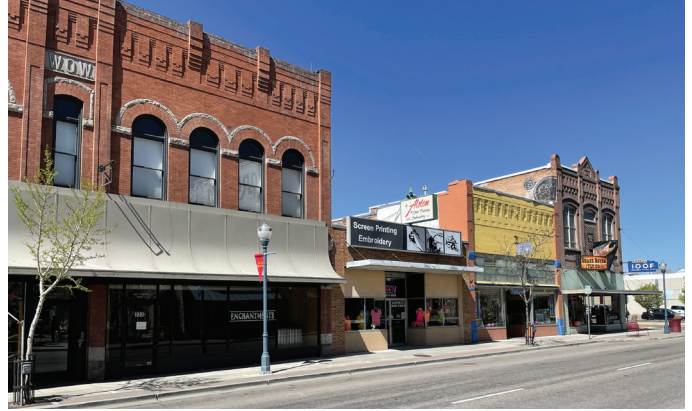
Pocatello Historic District Pocatello, ID (NRHP #82002505)