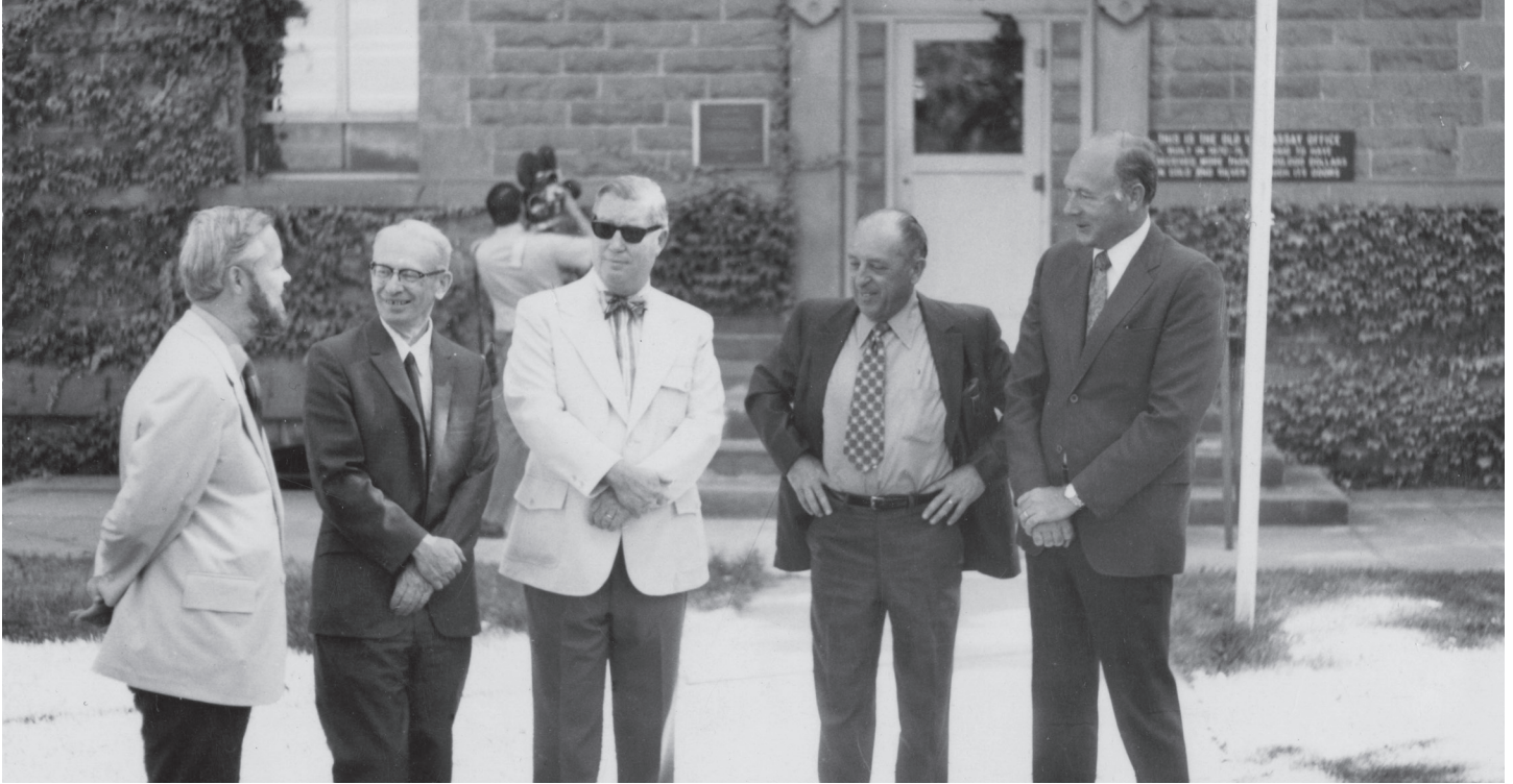
72-100-92a_US Assay Office transfer