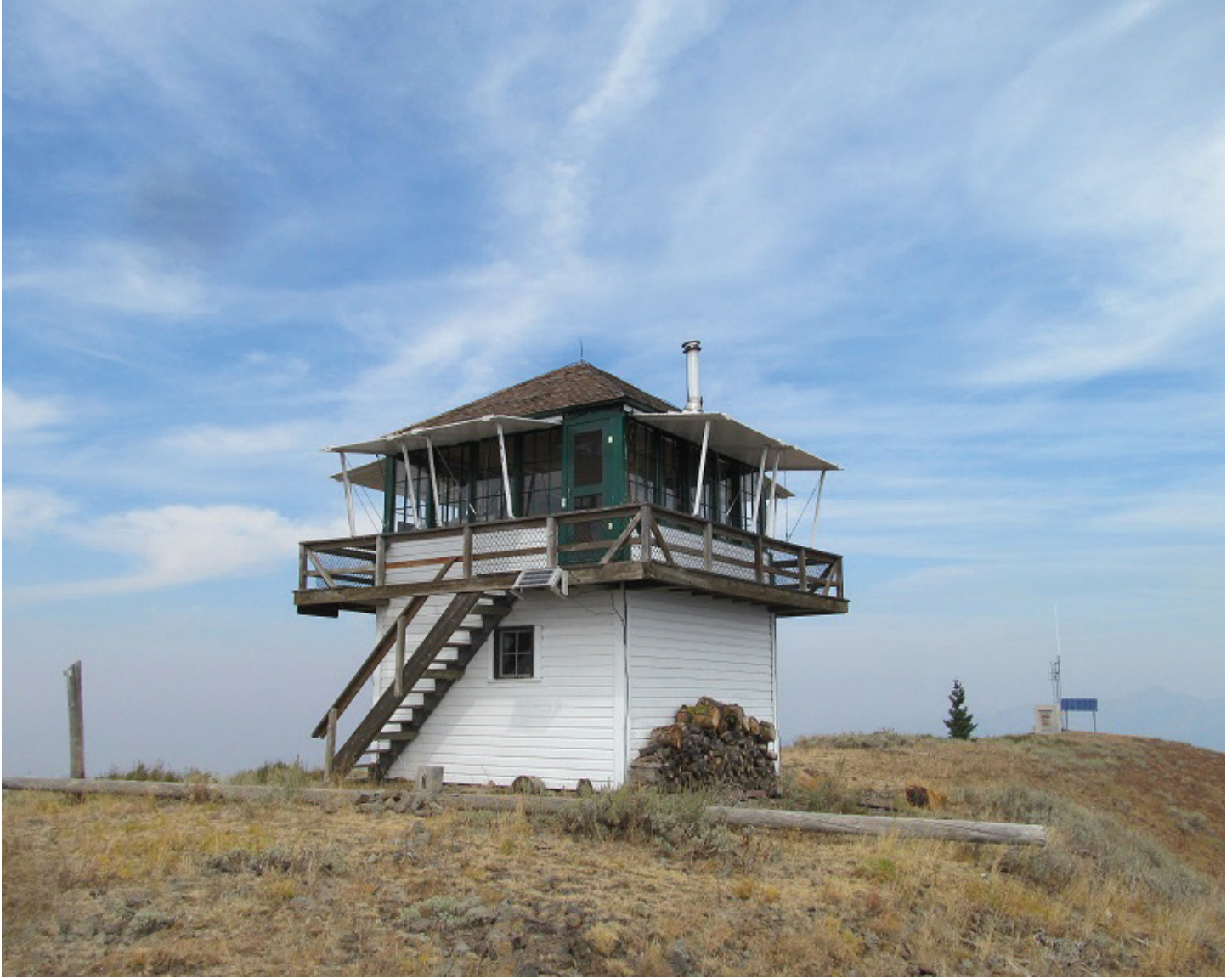
Indian Mountain Fire Lookout Adams County, ID (NRHP #100007977)