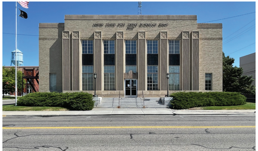
Blackfoot Main Post Office Blackfoot, ID (NRHP #89000128)

Preservation Idaho is a state-wide nonprofit organization dedicated to preserving Idaho's historic places through collaboration, education, and advocacy.