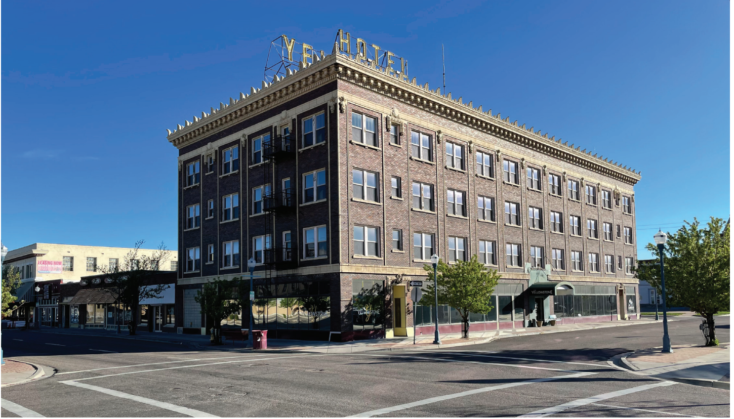
Stanrod-Daniels (Yellowstone Hotel) Pocatello, ID (NRHP #82002505)