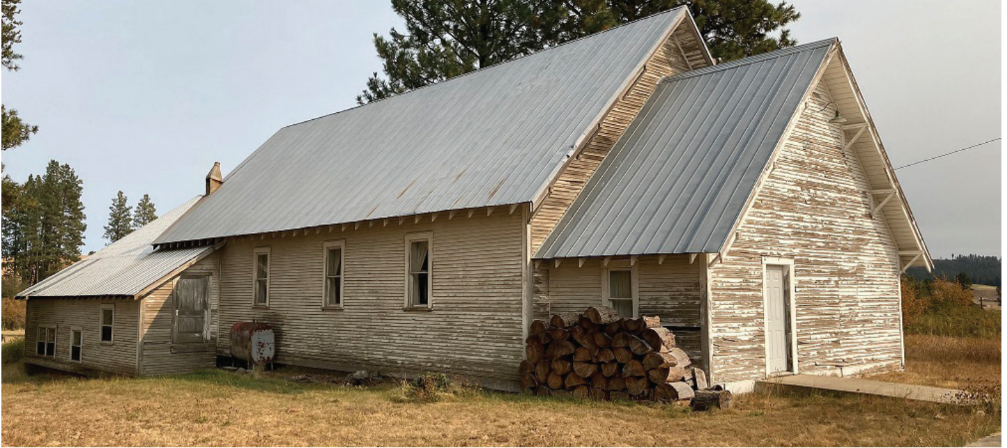
Mountain Home Grange Hall Latah County, ID (NRHP #100007014)