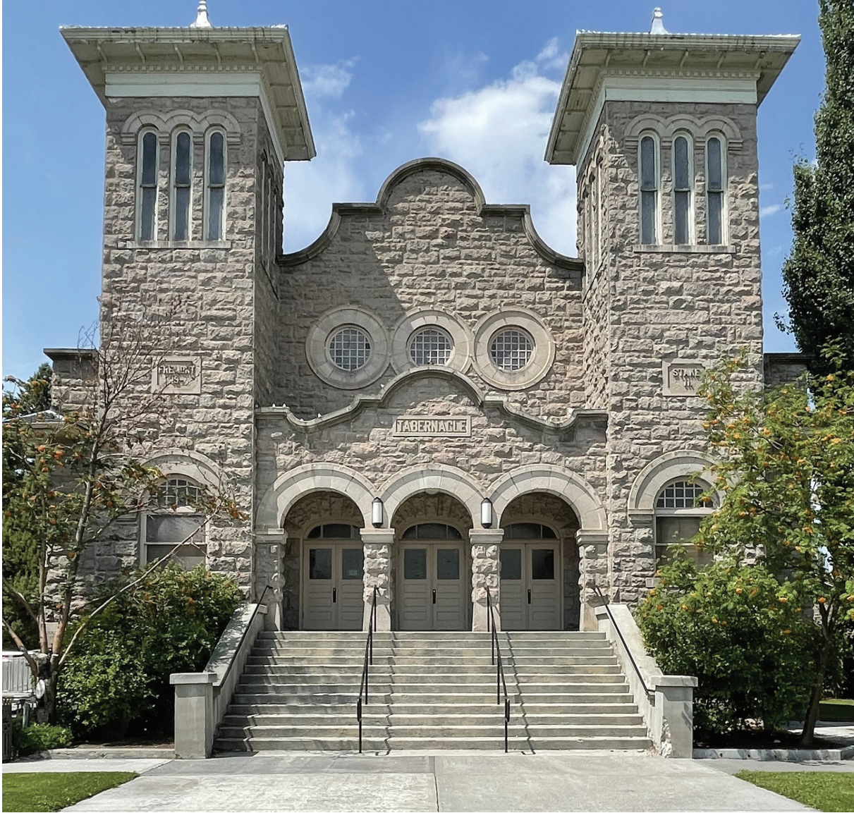
Rexburg Stake Tabernacle Rexburg, ID (NRHP #74000745)