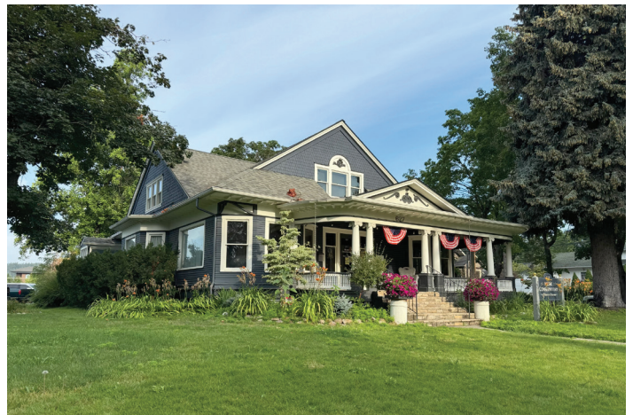
Hamilton, Boyd and Alta House Coeur d'Alene, ID (NRHP #100007118)

Recreation and tourism demands are increasing in Idaho, from the growing number of new residents as well as from external visitors. According to the Idaho Department of Commerce, the tourism sector of "Arts, entertainment, and recreation" grew 39% in direct earnings between 2019 - 2023 and grew 12.8% in direct employment. Statewide, direct state tax receipts for all tourism sectors increased 34.7% during that same time period. Many surveys throughout the country consistently show that historic sites are among the most popular destinations for vacation travelers. As such, Idaho's communities have an opportunity to capitalize on this desire for heritage tourism by highlighting historic properties in ways that may draw tourism dollars into the local economy.