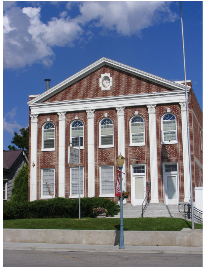
American Legion Malad Post 65 Malad, ID (NRHP #10009874)

Another factor is that full and comprehensive surveys of rural areas for all potential historic sites are rare. Urban surveys to identify eligible properties are more efficient and therefore more fiscally achievable than large rural studies; the latter tend to be more expensive to conduct and generally have far fewer eligible properties (in terms of raw numbers). Although there are vast regions of Idaho so rugged and inhospitable that they have virtually no historic buildings or structures, it is clear that long-range planning efforts should include increased survey work for the identification and nomination of historic resources in more rural areas of the state. Efforts made toward this end since the last IHPP include survey work completed by county-wide Certified Local Governments throughout the state. Much of the information regarding Idaho's built environment resources comes from CLG surveys like these in both urban and rural areas.