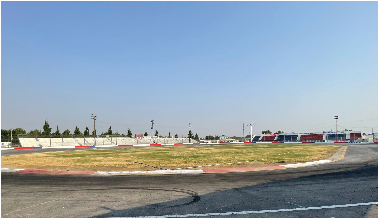
Meridian Speedway Meridian, ID (NRHP #100008284)

Finally, since the previous plan was adopted, the natural rotation of staff at various historic preservation-related organizations throughout the state has resulted in a fresh influx of ideas and skills. Most notably, many of these recent additions to the historic preservation and archaeology communities bring with them a wide range of highly technical skills and ideas. These will be vital to bringing Idaho's historic preservation efforts into the next century.