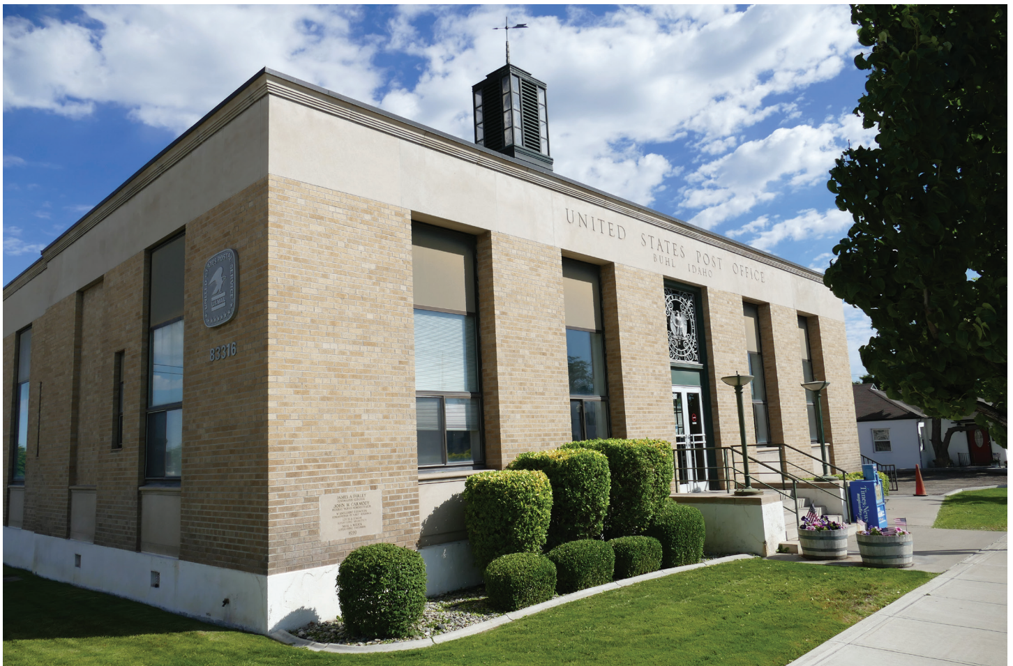
Buhl Main Post Office Buhl, ID (NRHP #89000130)