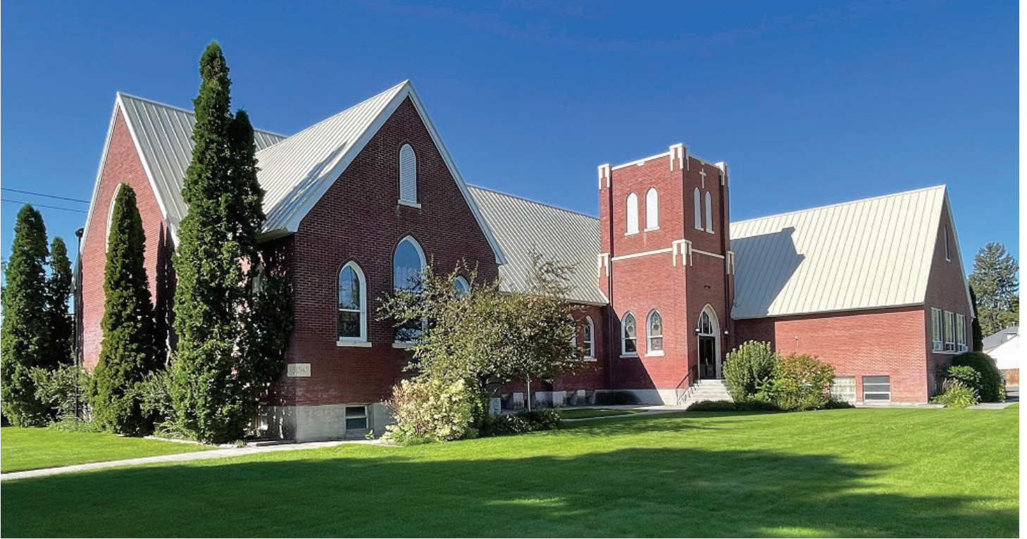
St. John Lutheran Church Idaho Falls, ID (NRHP #100009872)