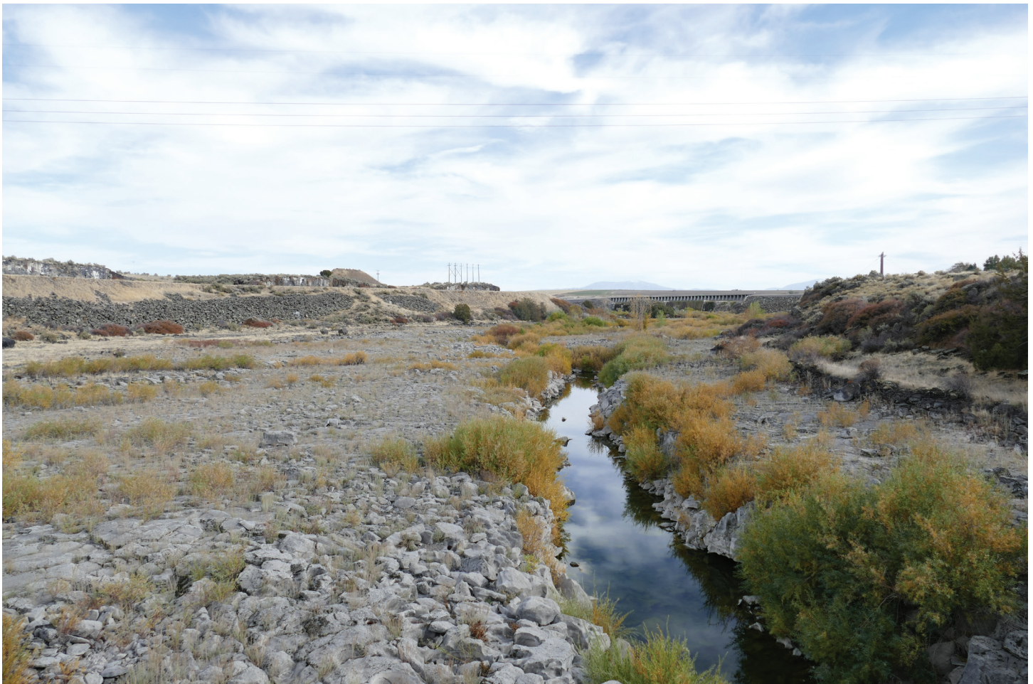
Minidoka Dam and Power Plant Minidoka County, ID (NRHP #74000746)

USGBC The United States Green Building Council is a nonprofit organization that promotes sustainability in how buildings are designed, built, and operated.